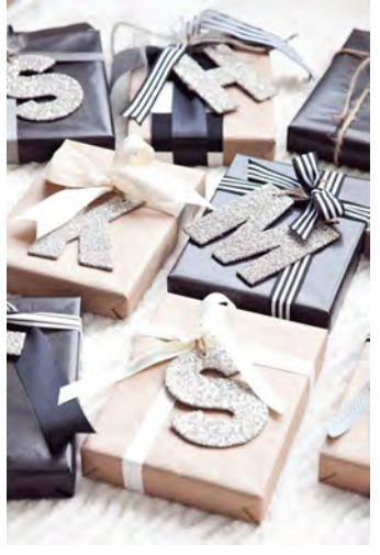
GRAPHIC Natural and black, cut out letters in sparkly card and add stripy ribbon.

Put some thought into how you are going to present your present! Get creative with gift wrapping and select a theme with arty bits you have or visit a local craft shop for ribbon, trims, letter stamps and card punches. If you are visiting Godalming, take a browse in Arty Crafty in Church Street, Godalming as it's full of gorgeous inspiration to get you into the 'Christmas creative' mood. Tel: 01483 427133.