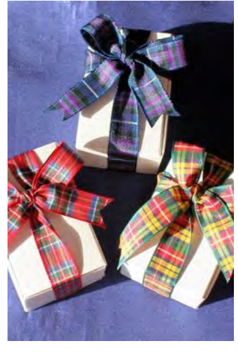
TARTAN Multi-coloured tartan ribbon, a different plaid for each gift.