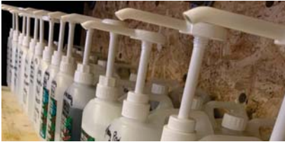
Top: Liberty Fall dolls, £34; Candles, from £9 Copper Bow, Line Drawings, from £35 Charlotte Stamouli; Sterling silver Tiny Things, from £30 Ned + Sloan. Above and right: Giant Knit Kits, £39.99; Kids PJs, from £22 Toucan Toucan; Hand Drawn maps, from £25 Katie Hickey. Left and below: Pumps and re-fill bottles from the Eco Corner; Coconut Bee products, from £8; original art by Cedar's Yard.