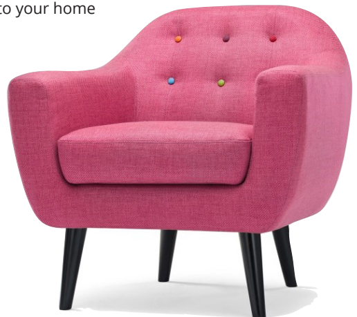
Highlight belts, Pure Collection ; yellow clutch, Whistles ; pink chair, Made.com