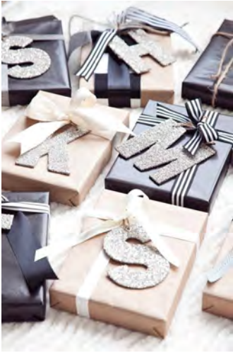
GRAPHIC Natural and black, cut out letters in sparkly card and add stripy ribbon.

Put some thought into how you are going to present your present! Get creative with gift wrapping and select a theme with arty bits you have or visit a local craft shop for ribbon, trims, letter stamps and card punches. If you are visiting Godalming, take a browse in Arty Crafty in Church Street, Godalming as it's full of gorgeous inspiration to get you into the 'Christmas creative' mood. Tel: 01483 427133.