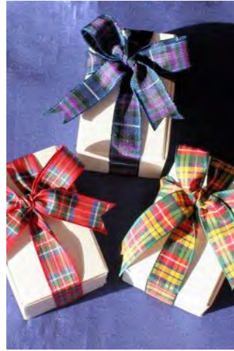
TARTAN Multi-coloured tartan ribbon, a different plaid for each gift.