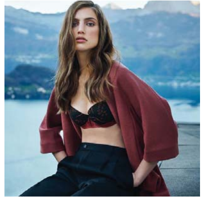
Above: Marie Jo embroidered Lily collection