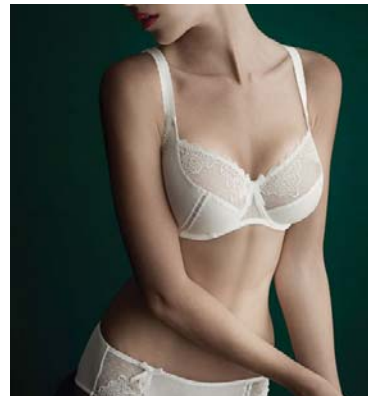
Above from left: Marie Jo Avero in Toffee; PrimaDonna Deauville collection in Ruby; and Empreinte Erin bra and briefs